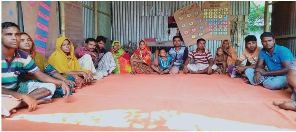
Couples participate in Dompotti session

Capacity building and enhance accountability of rights-holders and duty bearers: About defend, protect and promote rights of women and girls through civil society vigilance and monitoring Narinirjatonprotirodh committee have formed each Union.