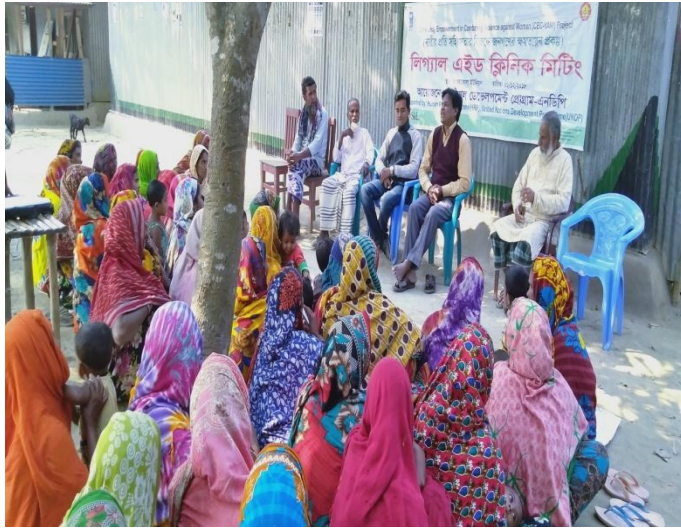
Legal Aid meeting conducting by Advocate

Legal aid Clinic meeting and Provide Legal support to Extreme poor: In Char Area people they do not know the different directions of the law. For this they do many crime in their unknowingly . In project timing 04 legal aid clinic meeting was done and provide legal support to 04 extreme poor.