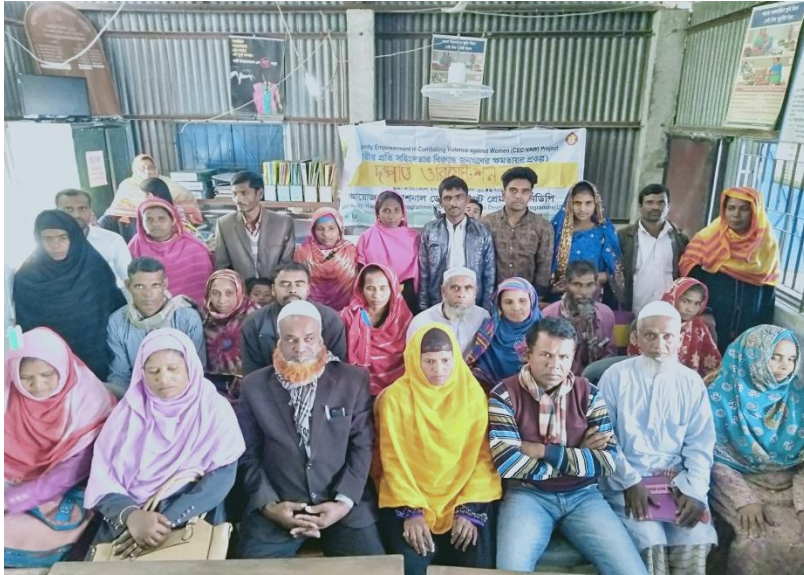
Dompotti Orientation to the PRIA group. Fifteen couple participated in the day long orientation from the two Union.

International Women’s Day observation in two Union: .Human chain, Rally, discussion, cultural program, Village sports competition were held 8 th March for IWday . In these program local resource persons , Adolescent girls & boys, Youth, women participated and enjoy.