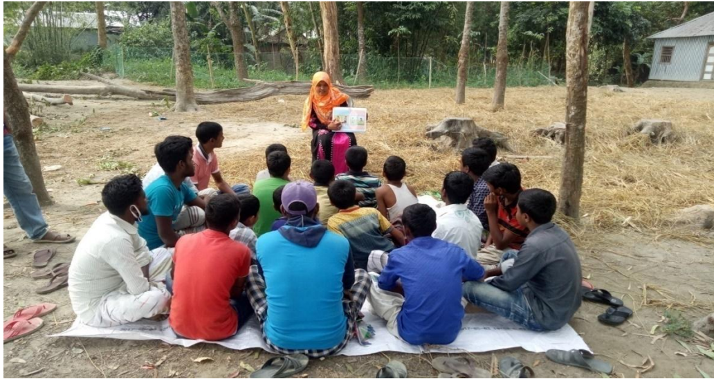
MVP group planning their action plan

mentor for violence. They take part for created awareness in the community of early marriage and sexual harassment. In VAW day, they participated of rally, discussion and essay competition. They made a sexual harassment protection committee in their village. They made a theater group for showing street theater. In International women’s day they arrange a cultural program in their village. Their group presented a drama of early marriage and domestic violence. They made a quarterly action plan for their tusk.