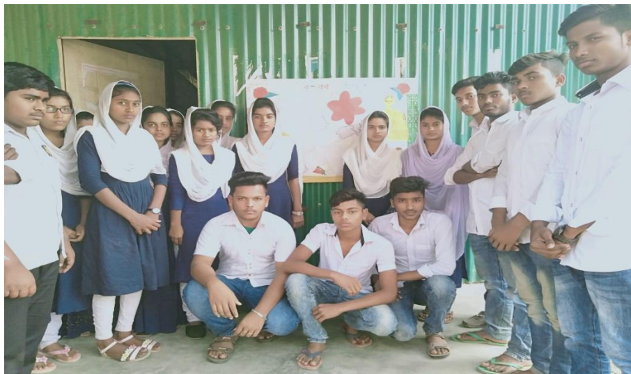
Mentoring Development training to the GEMS group. They made a wall magazine by their own writing about VAW