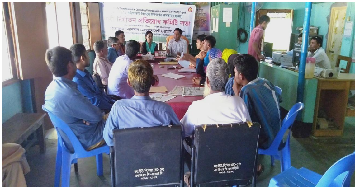
NNPC meeting In Kawakola Union porishod

Capacity building and enhance accountability of rights-holders and duty bearers: About defend, protect and promote rights of women and girls through civil society vigilance and monitoring Narinirjatonprotirodh committee have formed each Union.