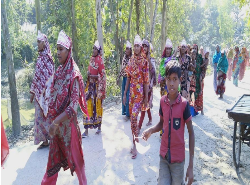
Village women participated in VAW Protection day Observation Rally

Some different training provide to different participants: