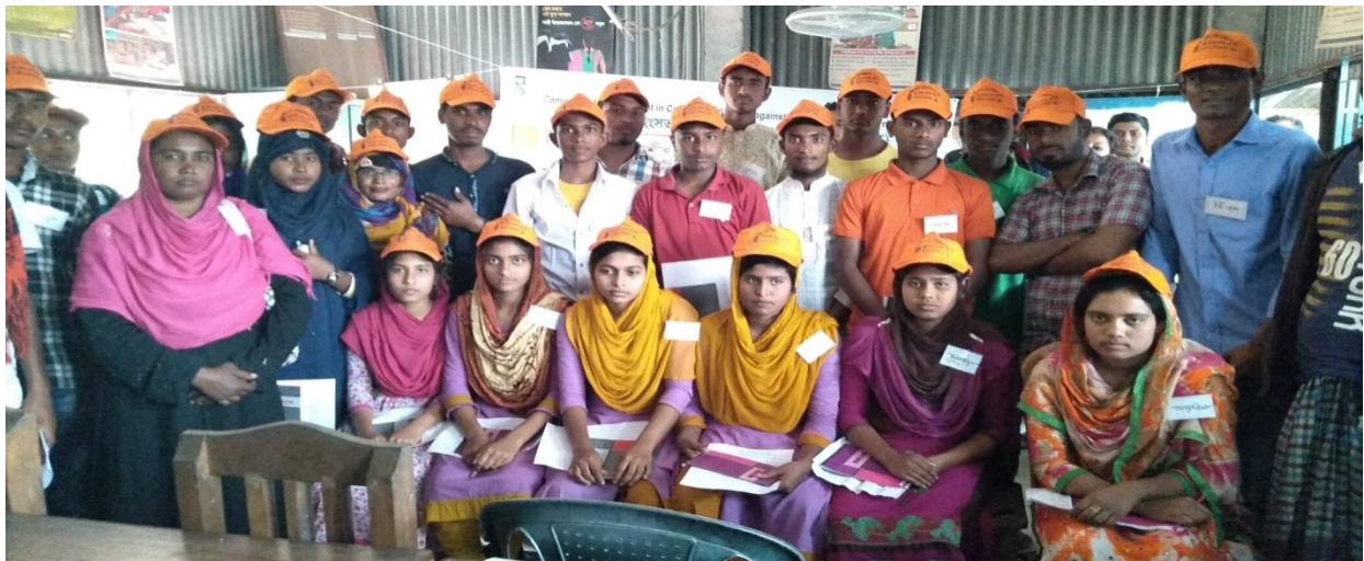
Participants of Leadership development training of MVP group

Some different training provide to different participants: