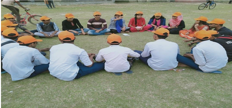
GEMS group discussing about their activities

Victim student can take action by GEMS group. Good students of GEMS group mentoring the others weak students.