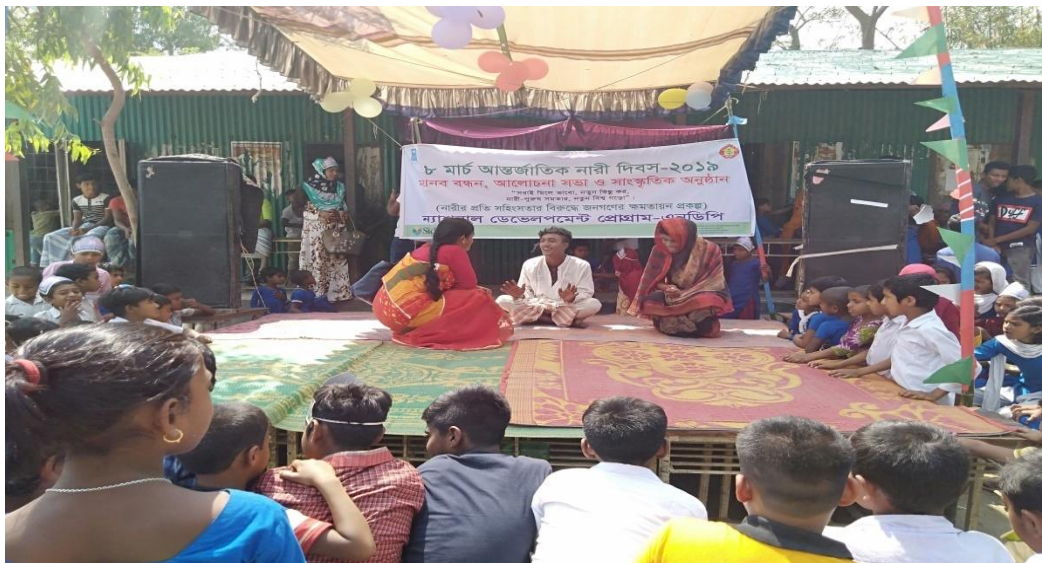
MVP group presented theater in International Women's Day

Formation of Adolescent School( Gender Equality Movement s by students – GEMS): To create awareness about women’s rights and dignity, A total of 2 school selected where 2 GEMS formed. Each GEMS have 15 members, with a president and a secretary. The GEMS create and awareness about gender. Two days long training named “Mentoring development Training” provided to them. They made a action plane which they can do in their school time. They made two wall magazine of Women’s violence. In this magazine their writing creativity skill developed. A committee of VAW protection also formed by SMC, teacher, students. A complain box put the school for protection the victimized student.