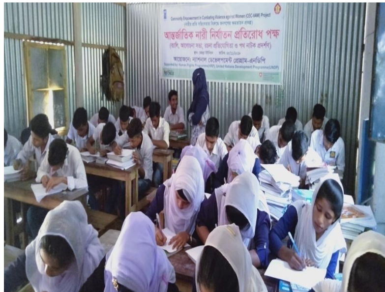
School Essay competition about VAW Protection

International VAW protection Day observance campaign : Different activities was done In two Union for International VAW protection campaign. Especially Rally, Discuss, Drama show, symbol , essay competition, Court yard meeting were done in the VAW campaign. Root level village women were participate with enjoy in this program.