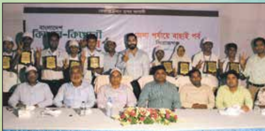
Student Adolescent Conference